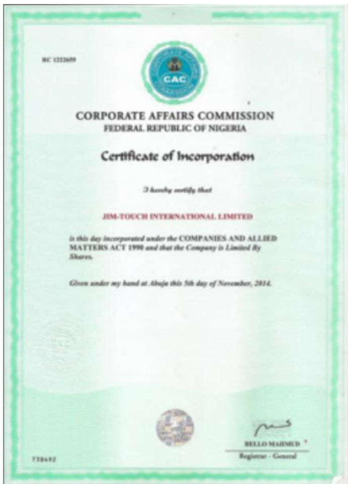
Registered Certificate of business

http://www.mirekw.com/winfreeware/files/MWSnap300.exe