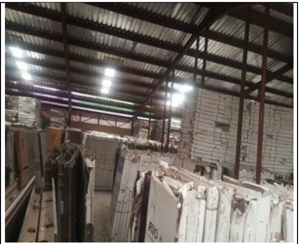
Another Section of our Warehouse