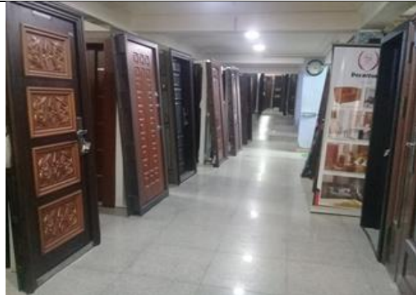
A Section of Showroom in our Head Office