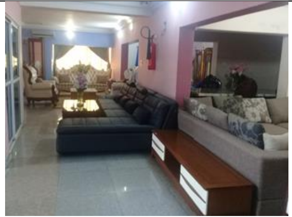
A Section of Showroom in our Head Office

This form filled in & approved by CEO/Director of Goldline Nigeria Limited on: 24/04/2019; The information declared as above mentioned is true and in accordance with the law of Nigeria.