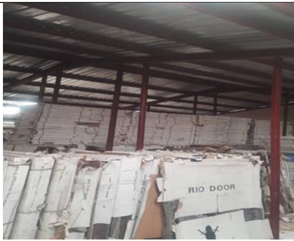
Another Section of our Warehouse