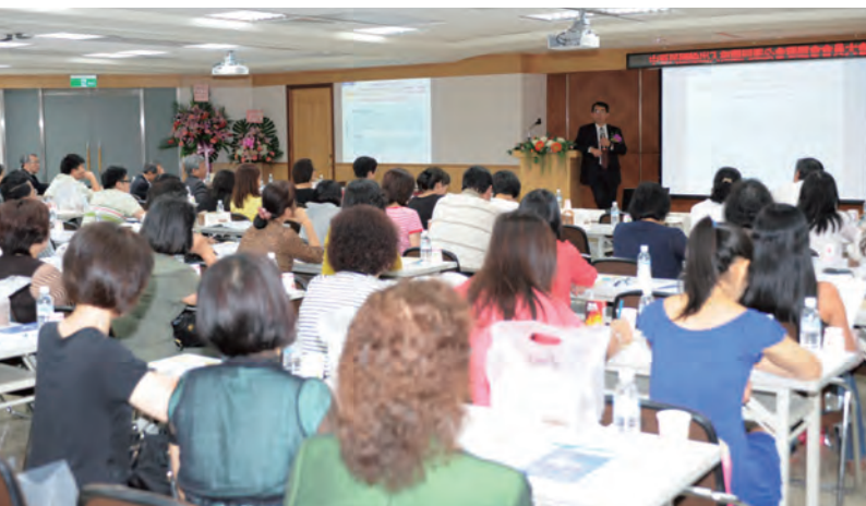
召開「中華民國輸出入相關同業公會聯誼會」會員大會 Joint session with the Federation of International Trade Related Associations