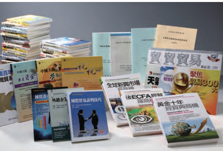
出版《貿易雜誌》與經貿叢書 The Trade Magazine and trade-related publications