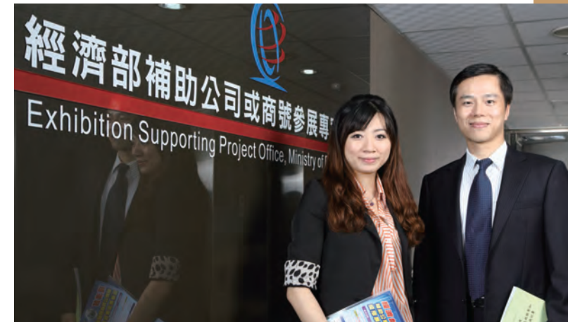
成立「經濟部補助公司或商號參展專案辦公室」 Operations of the Exhibition Supporting Project Office, MOEA