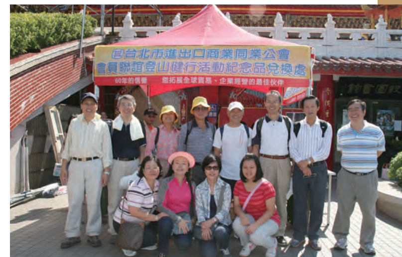
成立「中華民國全國進出口商業同業公會聯誼會」 Setting a Council of Taiwan Importers and Exporters Associations