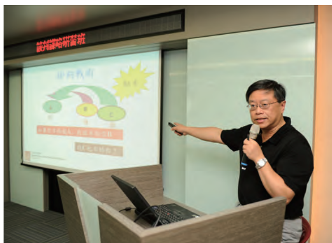
舉辦「國際酒類產品貿易推廣會」 International Wine Promotion