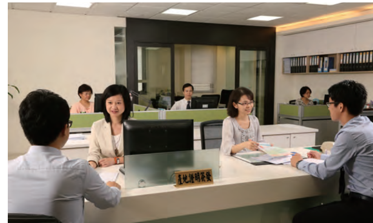
簽發原產地證明文件 Certificate of Origin issuance