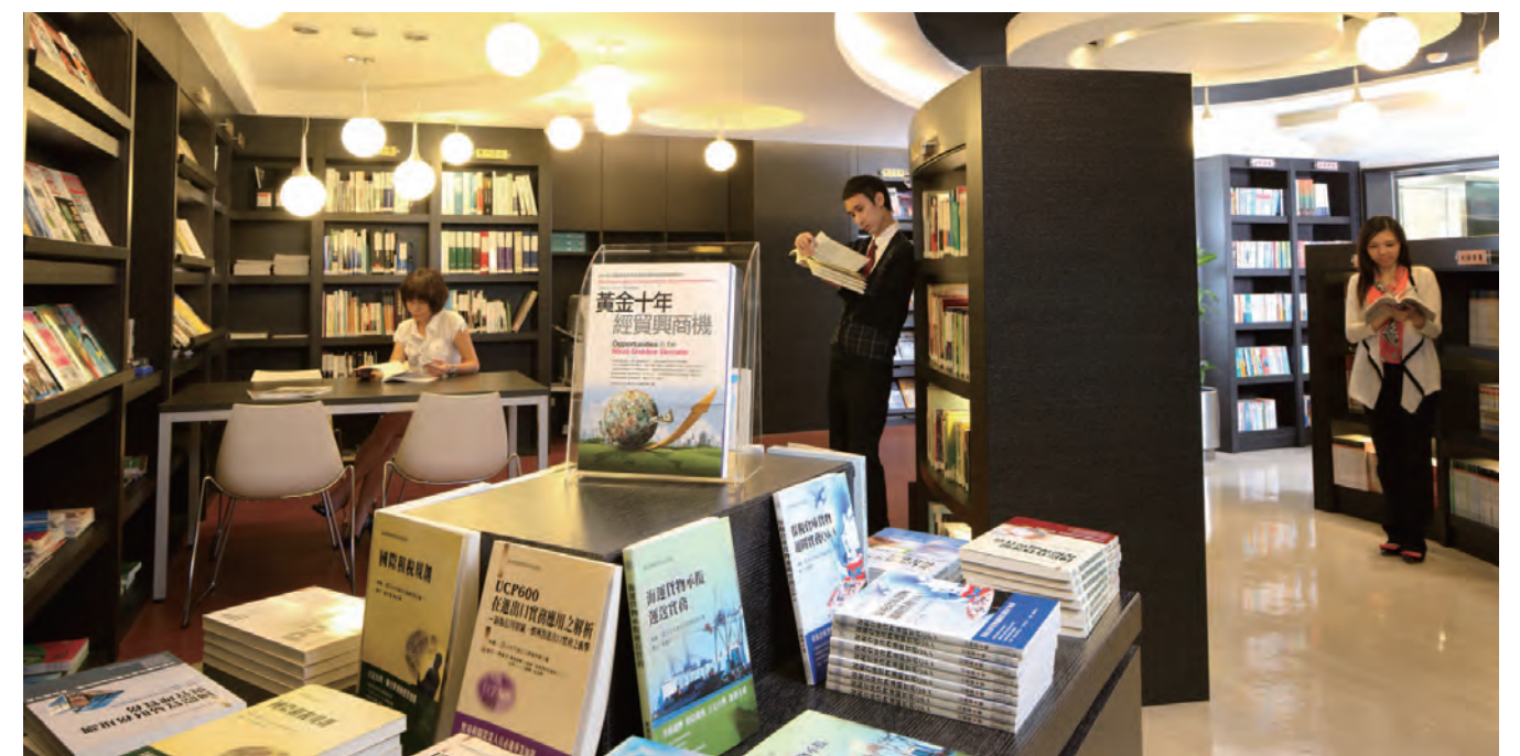
提供資訊查詢服務 Information resources service