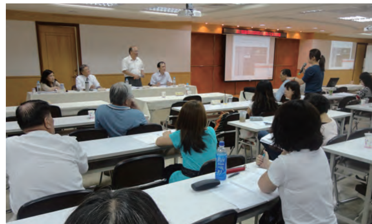
向主管機關提出建言 Making recommendations to government agencies