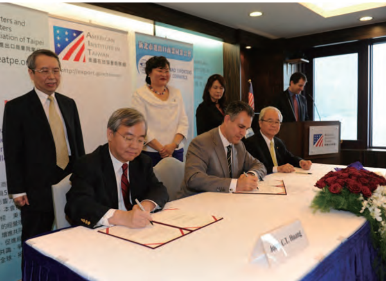
與美國商務部簽署合作意向書 IEAT signed S.O.I. with US Department of Commerce