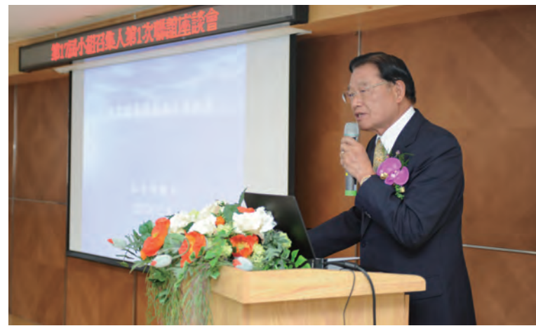
召開小組正副召集人聯誼座談會 Joint meeting of working group conveners