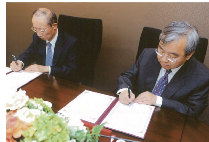
與「海峽兩岸經貿交流協會」簽訂合作備忘錄 IEAT signed with the Association of Economy and Trade Across Taiwan Straits

The IEAT is committed to providing quality service catering to members' needs. It has maintained ISO 9001 certification every year since 2002 and received service excellence awards by the Ministry of Economic Affairs (MOEA), the Mainland Affairs Council, and the Taipei City Government. The association also engages in charity work, community service, and services to national servicemen and their family members.