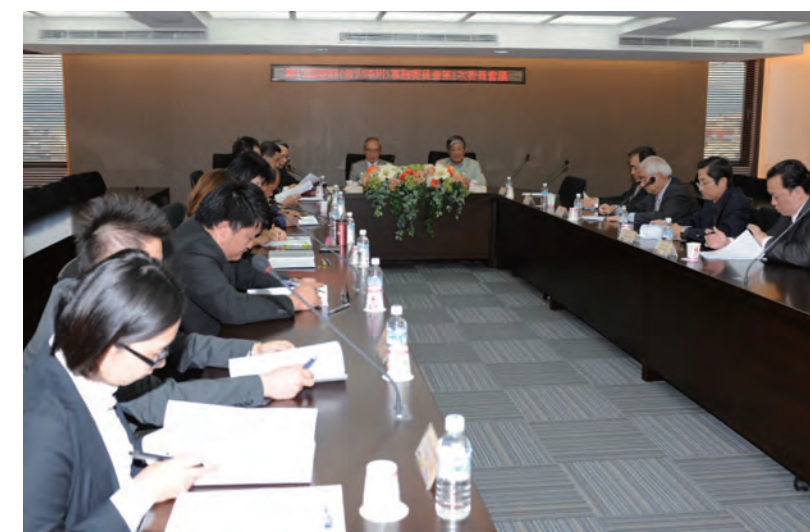
召開亞洲事務委員會會議 Meeting held by the Asian and Oceania Affairs Committee

The Secretary-General and the Deputy Secretary-General manage the daily operations of the International Affairs Division, Mainland China Affairs Division, Domestic Affairs Division, Information Service Division, Trade Professional Certification Division, Finance and Administration Division, and General Affairs Division staffed by 41 officers. In addition, the IEAT is commissioned by the Bureau of Foreign Trade to run the Exhibition Supporting Project Office, MOEA (ESPO) to assist companies obtain subsidies for participation at international exhibitions.