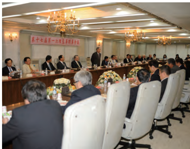
常務理監事會團隊 Board of Directors and Board of Supervisors members