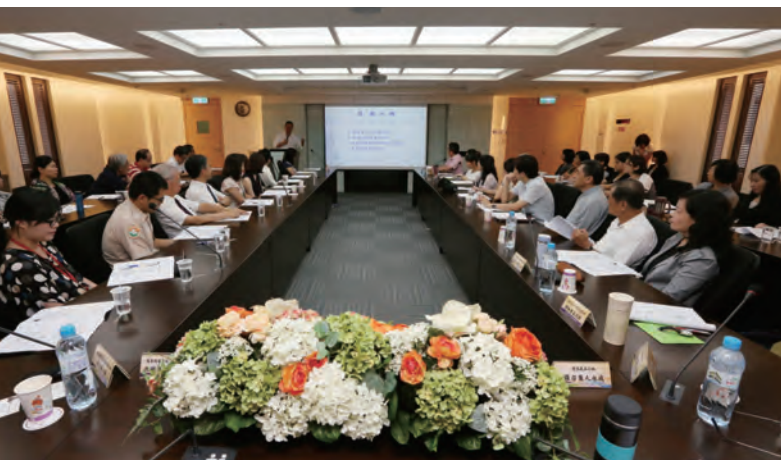
召開行業小組會議 Meeting of the industry-specific working groups