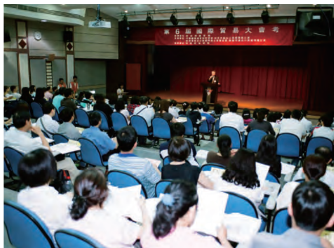
頒發國際貿易獎學金 International Trade scholarships