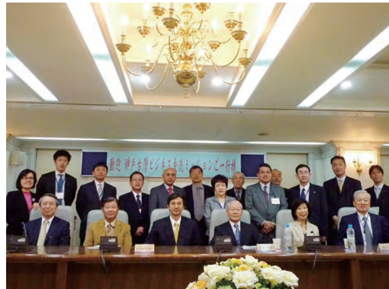
接待神戶台灣經濟交流訪問團 IEAT played host to a Kobe economic exchange delegation