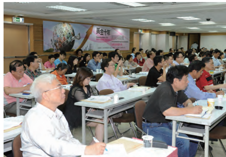
辦理全球市場貿易環境與風險調查計畫 Investment Environment and Risk Survey