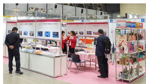
Exhibit at a joint booth