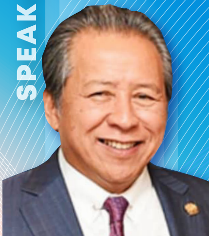
Yang Berhormat Senator Datuk Seri Panglima Anifah Aman Chairman of Invest Sabah Berhad cum Special Advisor to the Chief Minister of Sabah, on International Relations and Foreign Investments