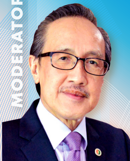
Yang Berhormat Datuk Seri Panglima Haji Masidi Manjun Minister of Finance Sabah